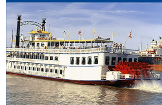
Enjoy a Riverboat Cruise

Departure: VFW 2144, 175 West 8th St, Holland, MI @ 8 am