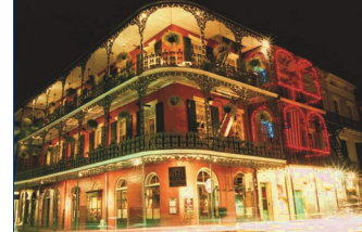
View the French Quarter